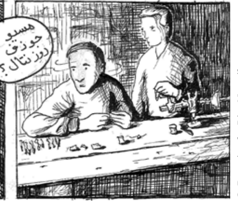
O Drawing by Rim Naguil