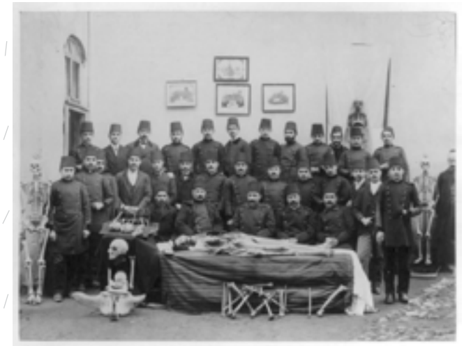
Photo: Medical School in 19th-Century Ottoman Empire